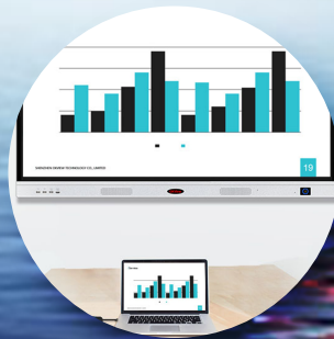
Fast Wireless Mirroring